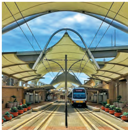
The DART (Dallas Area Rapid Transit) station at DFW Airport.

ITDP also examined the correlation between frequent transit coverage and STMS—walking, biking, and public transportation. The data shows that high-frequency transit correlates with higher ridership. Frequent service enhances transportation networks and improves the passenger experience. While major transit projects are most visible, cities often overlook more simple solutions like increasing bus frequency, improving bus service, and adding protected bike lanes. Even cities that already have several rapid transit systems find it useful to add frequent transit.